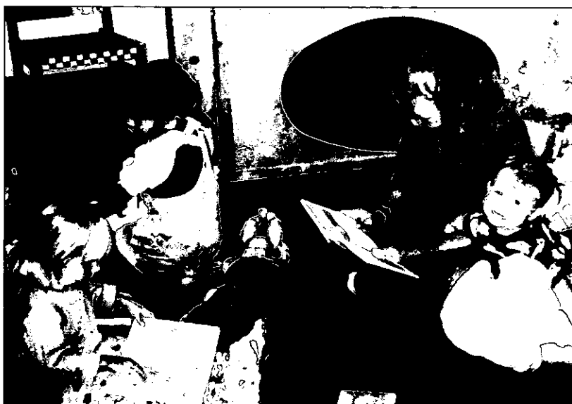
Unitarian Co-op Preschool in San Diego, California

Shortly after the program year begins, parents are usually required to take one or more evening or weekend classes focused on development issues appropriate to their child's age. The class may focus on common behaviors, effective interaction strategies, and how and when to